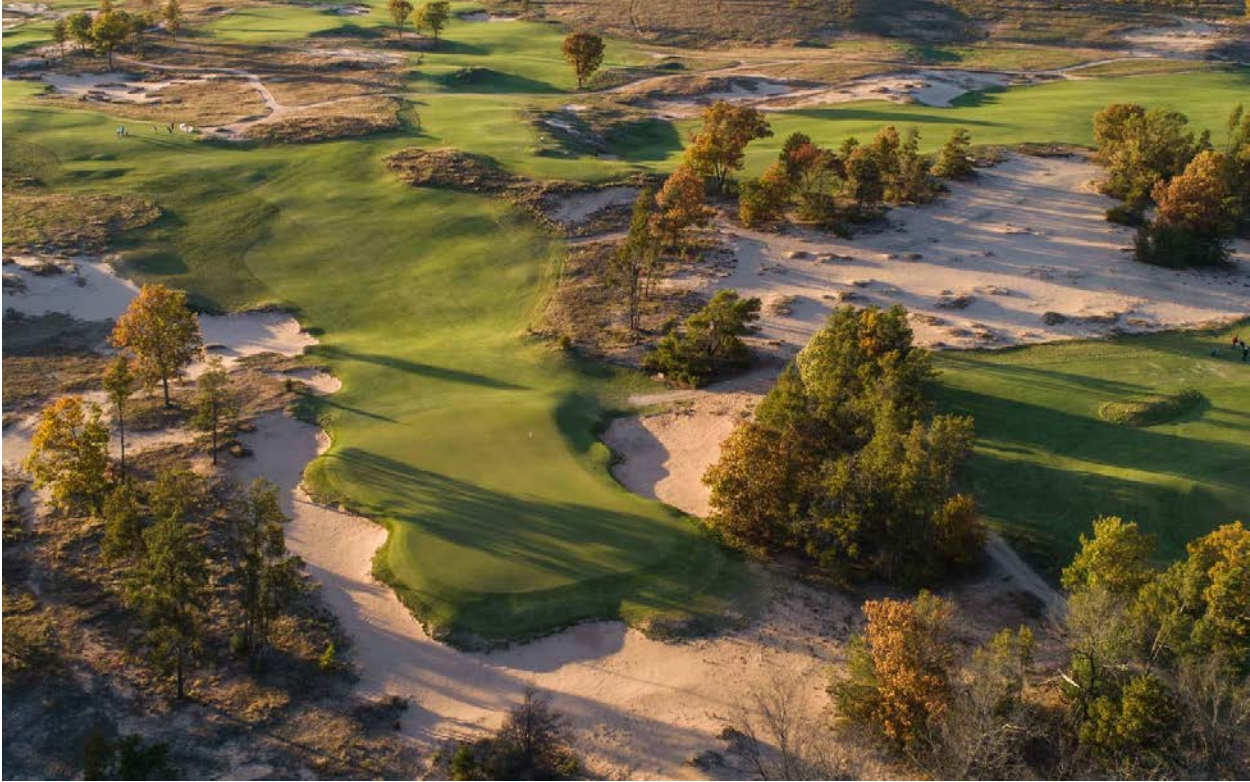
Coore and Crenshaw's Sand Valley