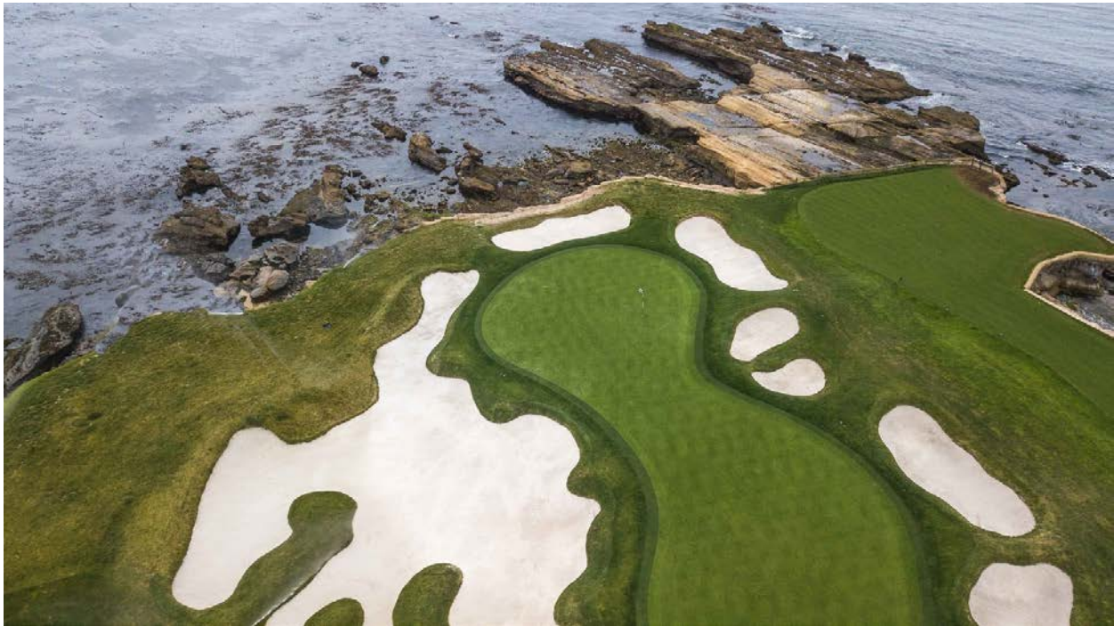
The 17th at Pebble Beach Golf Links