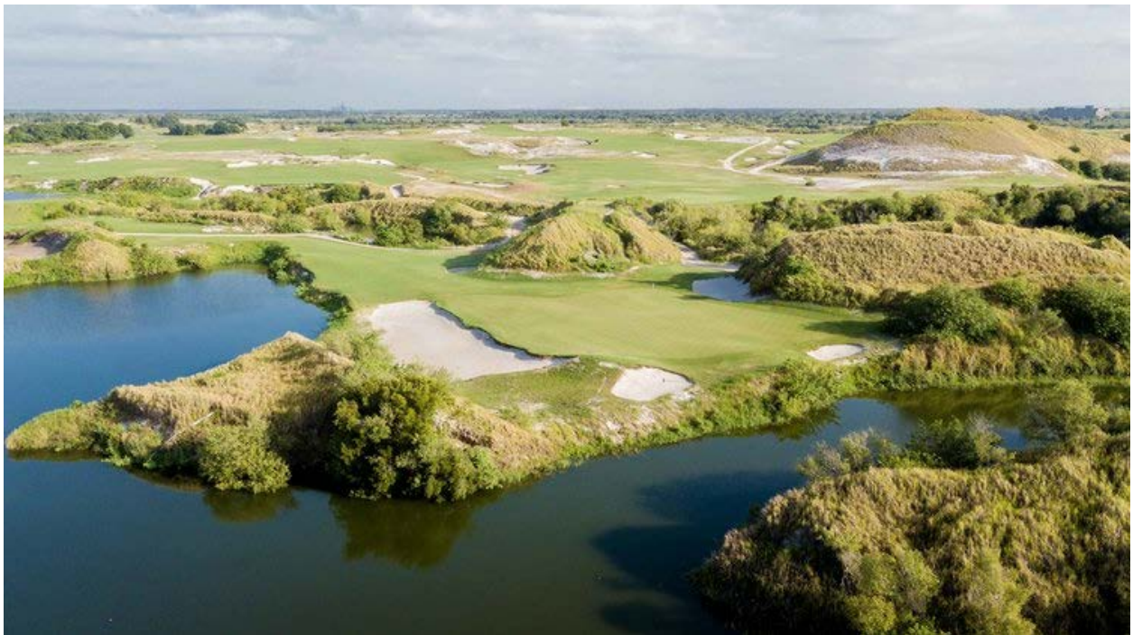
The red course shines.