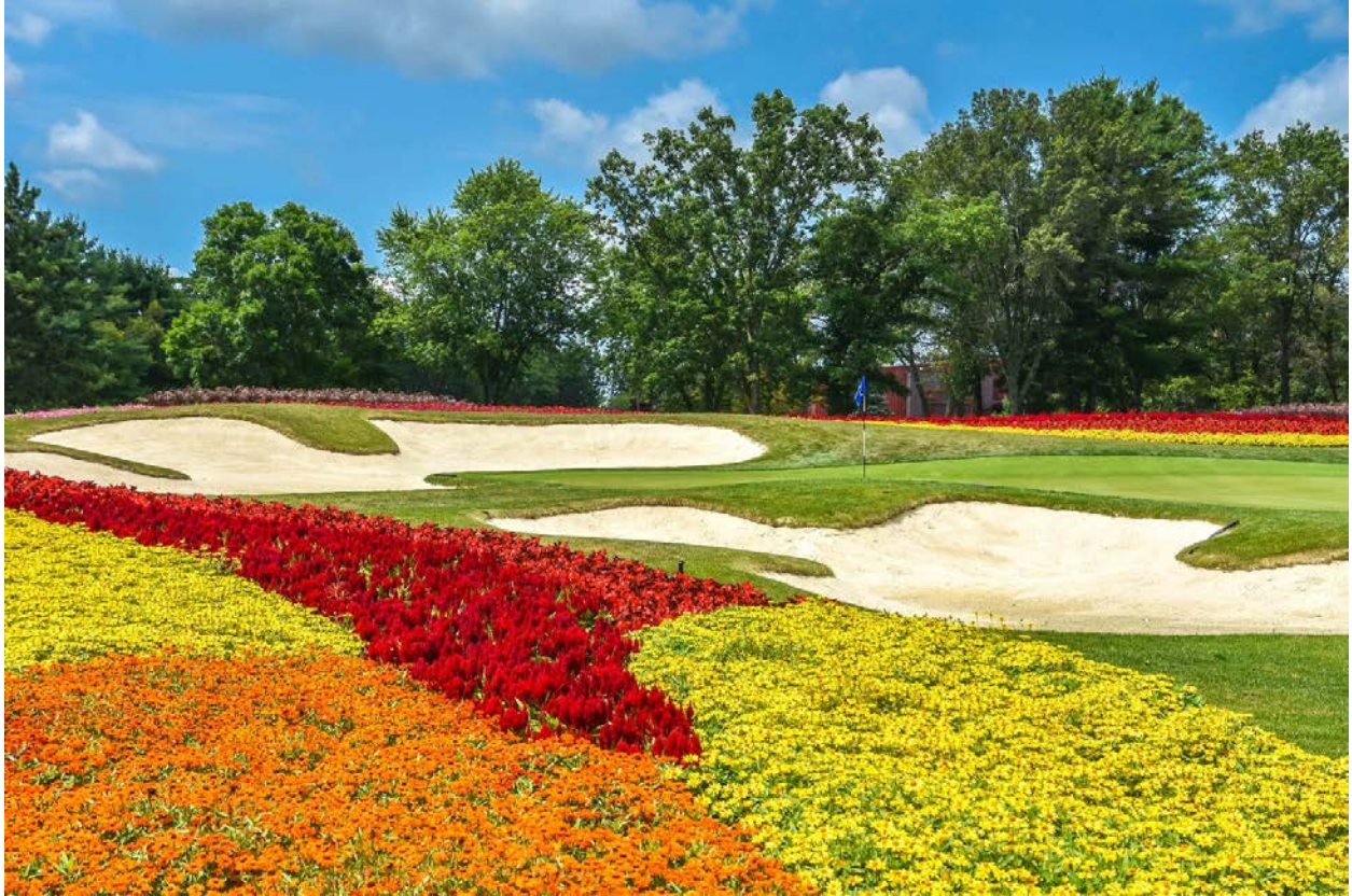
The flower hole at Sentry World features a new floral design each year.