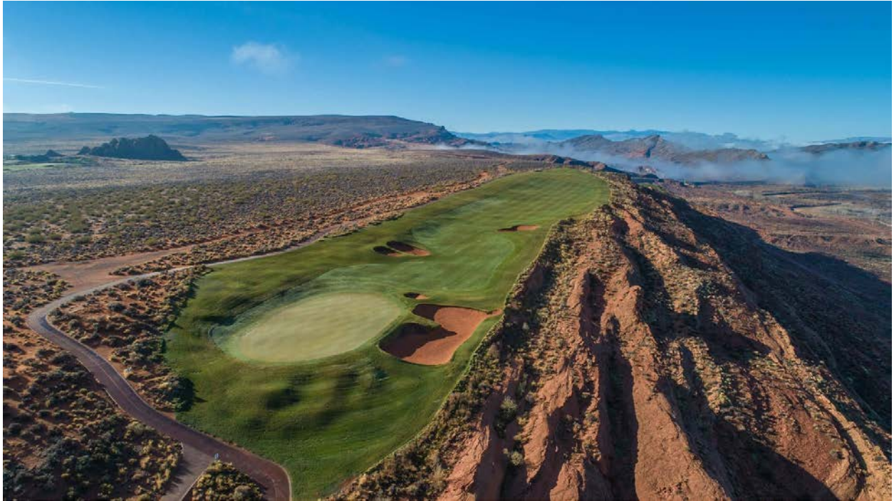
The 14th hole at Sand Hollow