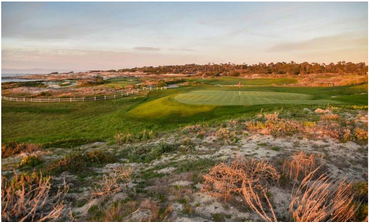
The 14th hole at Spanish Bay