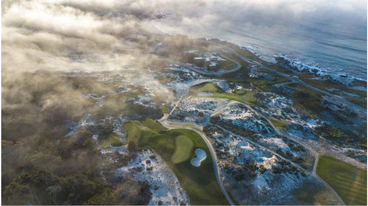
The 2nd and 3rd holes at Spyglass Hill