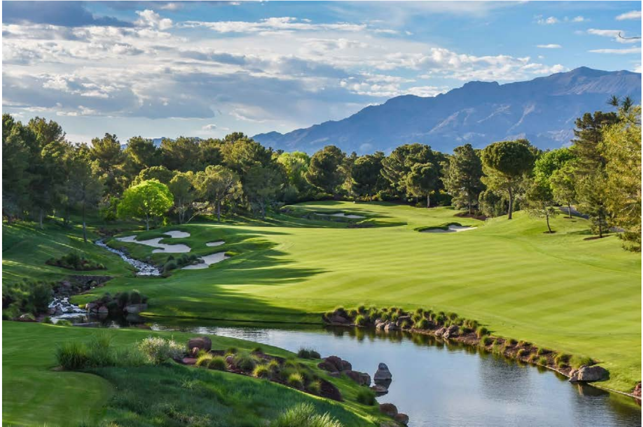
Tom Fazio's Shadow Creek