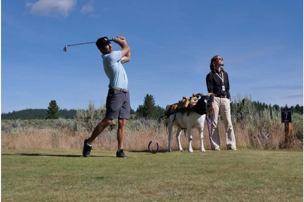
Bruce the goat caddy eyes and assesses the golf action.