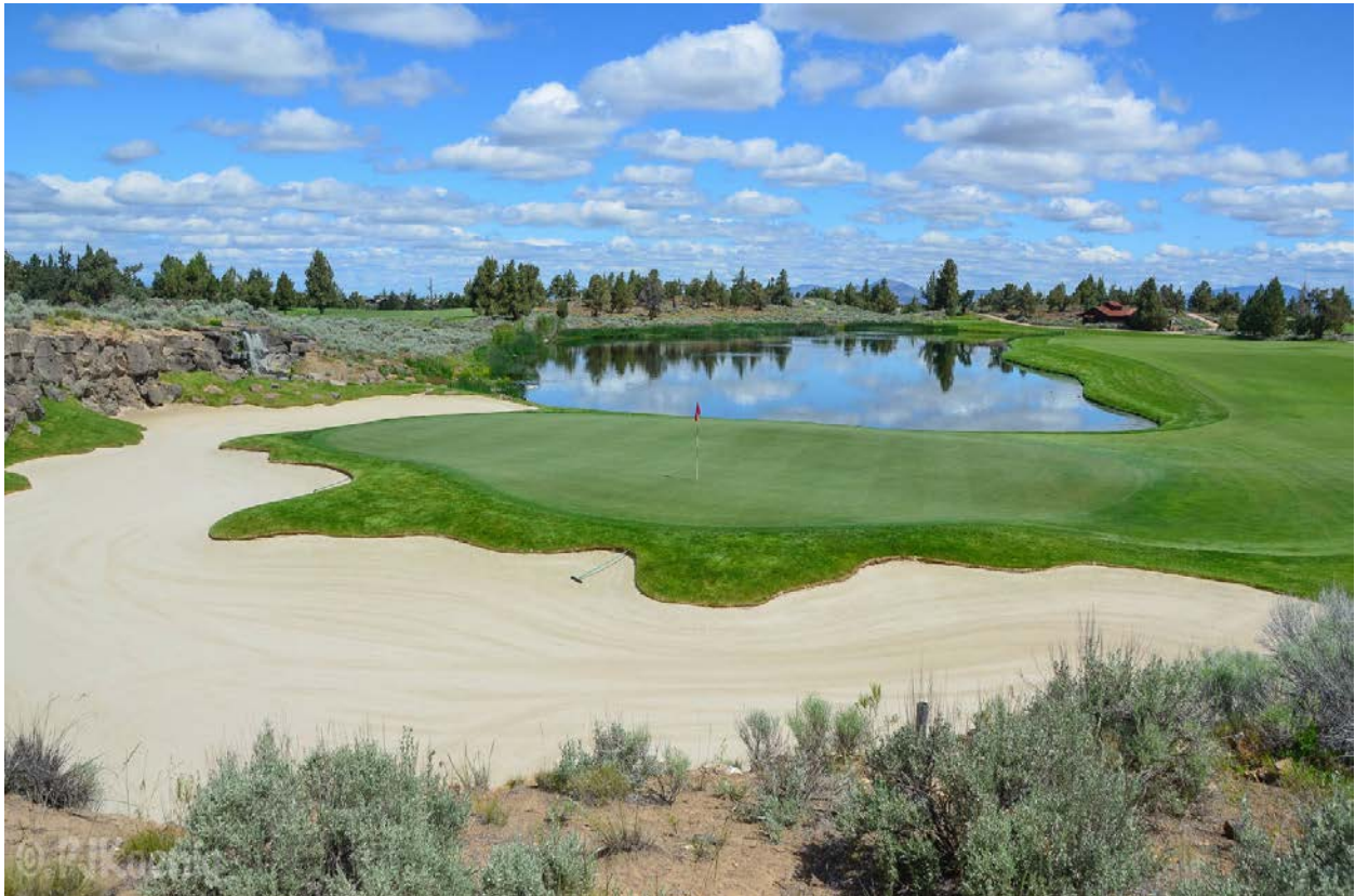
The Nicklaus Course at Pronghorn.

You can view the full list of Oregon courses here . I got em all covered.