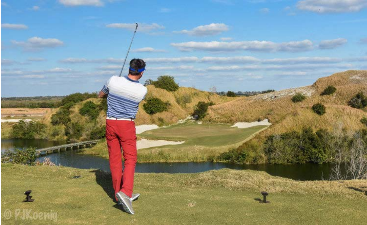
The Blue course's signature 7th hole.