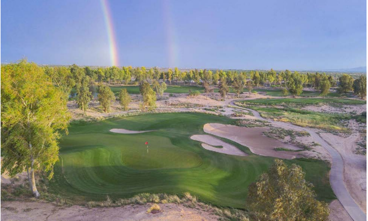
A double rainbow over the 11th hole at Southern Dunes

4 years ago, I wrote one of my first blog posts about a golf bros trip to Scottsdale. Read it here.