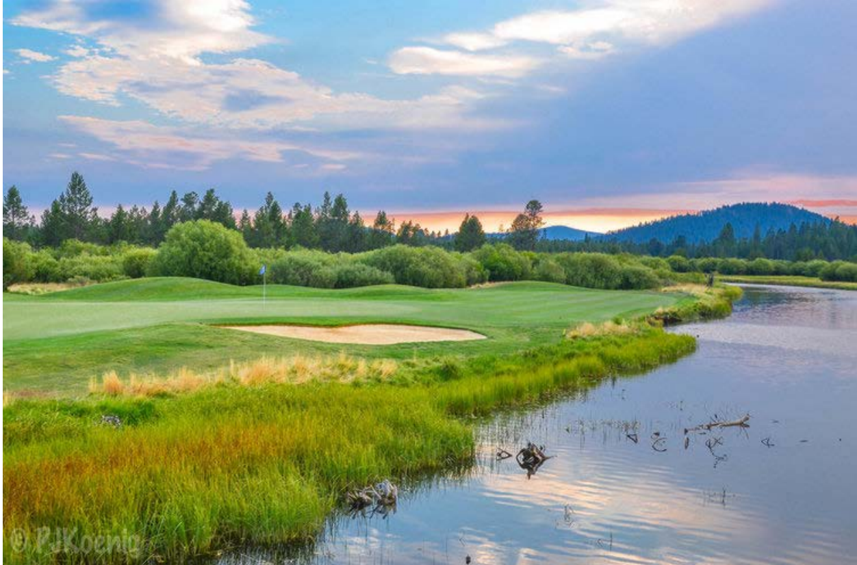
The finishing hole at Crosswater.