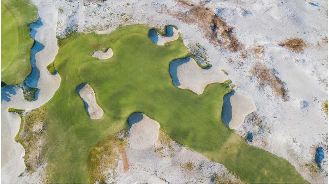
Gil Hanse's Black course at Streamsong