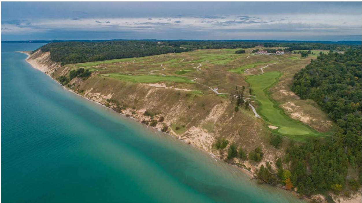
The aptly named Arcadia Bluffs in Michigan.

Depending on how you set up the trip, there can be a decent amount of traveling involved on a buddies trip to Michigan. I scoured the entire state over two weeks on the RGV Tour. Check out the recap here .