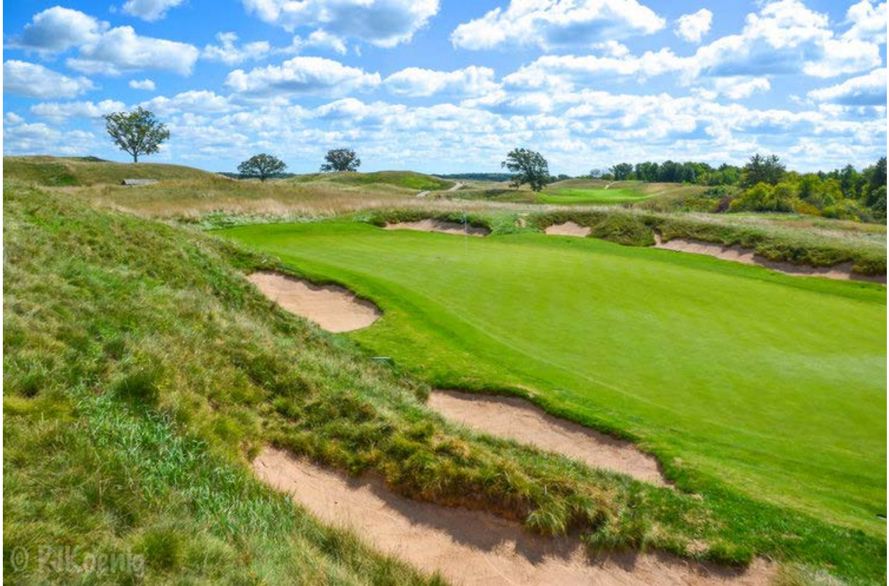
The 16th hole at Erin Hills