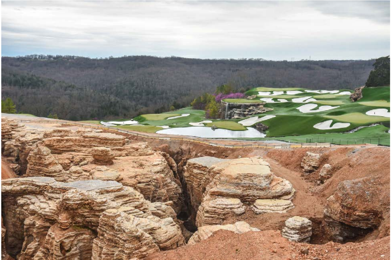
A giant sinkhole has been excavated in front of the range at The Top of The Rock.