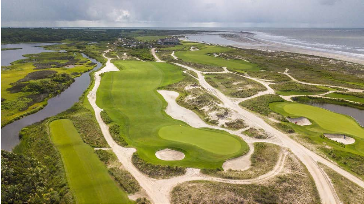
Kiawah Island's Ocean Course.