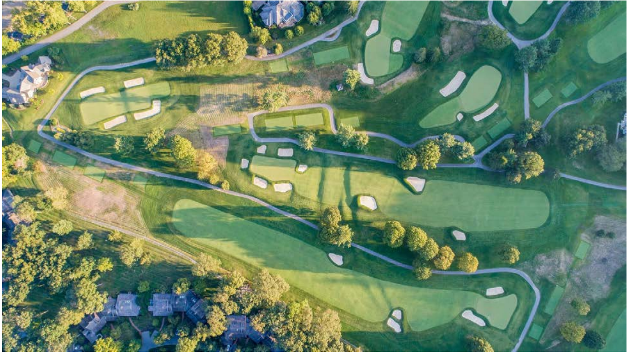
The Old White TPC course at The Greenbrier.