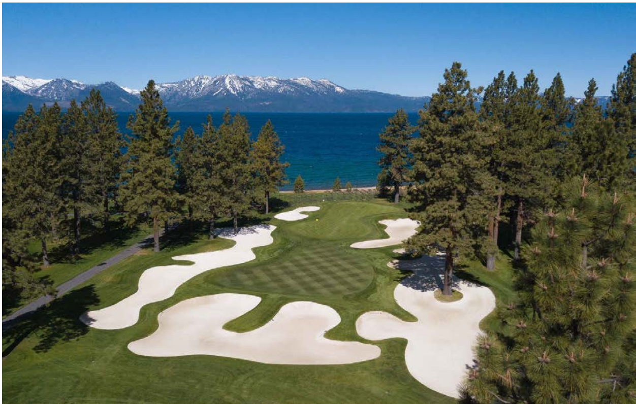
The 16th hole at Edgewood Tahoe