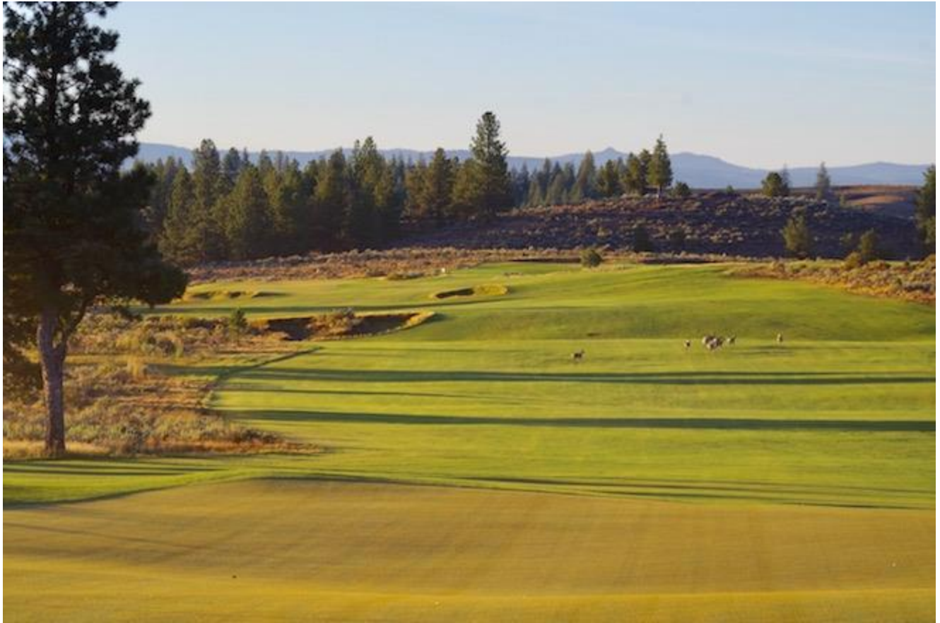
(Silvies Valley Ranch)

This brand-new resort in remote east-central Oregon has a fascinating, reversible Dan Hixson-designed golf course, and is actually offering a golf package centered around the eclipse. The “Total Eclipse of the Sun” package includes three nights’ accommodations, two rounds of golf (one in each direction the course can play), transportation to and from the path of totality (the resort is just a couple miles south of the actual path), and a resort activity, with choices including shooting, fishing, goat herding, cattle driving and others. The package starts at $1,800, based on single occupancy.